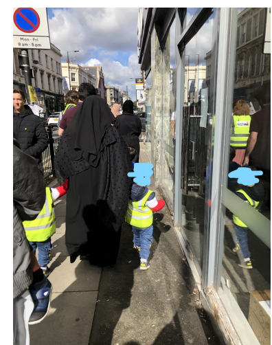
Walking bus for Mums with young children to get to Children's Centre sessions