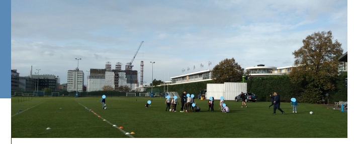
YP participate in extra-curricular sports run by a local VCS organisation